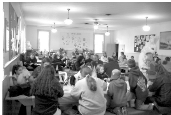
Some of the hungry crowd who came to support the Boosters at the Easter breakfast.

Another successful Easter Breakfast with the Easter Bunny held at the Beavercreek Grange on kamrath Rd. An annual event sponsored by the Beavercreek Boosters. There was an Easter Egg Hunt following the breakfast for the children at the Corner Park.